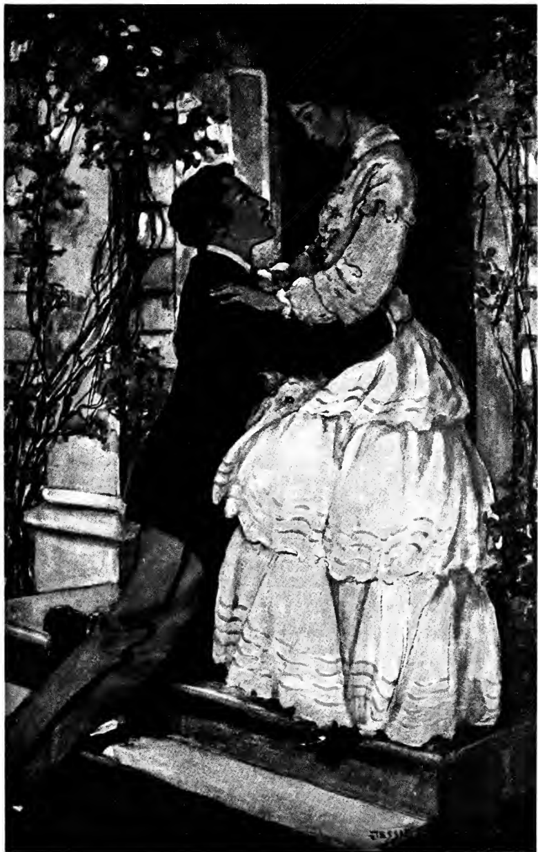
He put his arms about her, as she stood on the step above him. Page 394.